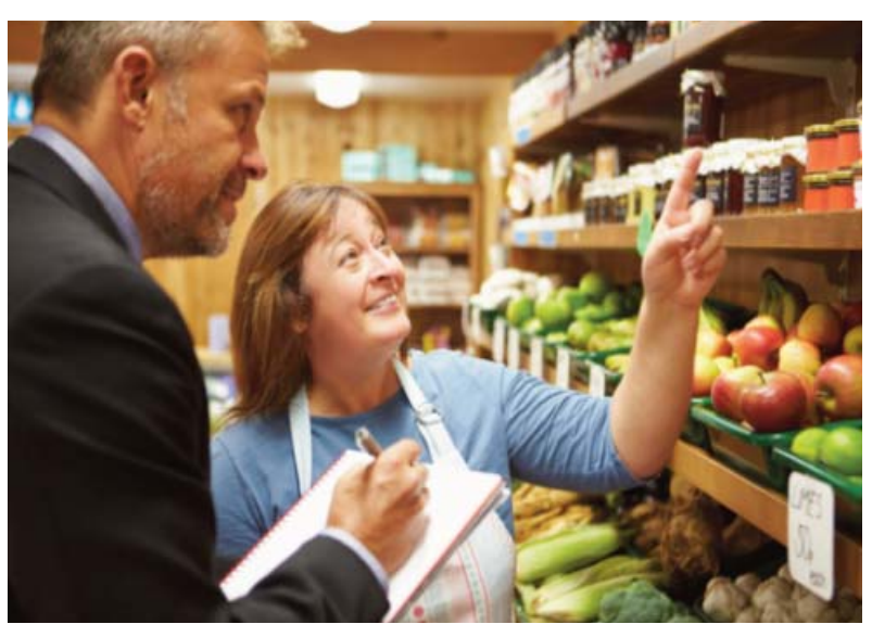
Within its jurisdiction, and professional and technical competence, a board of health shall make all necessary sanitary and health investigations and inspections.

Within 90 days after the end of the county's operating fiscal year, the board of health shall publish an annual report showing the condition of its trust on the last day of the most recently completed operating fiscal year, the sums of money received from all sources, giving the name of any donor, how all moneys have been expended and for what purpose, and such other statistics and information in regard to the work of the health department as it may deem of general interest. The report must be published in pamphlet form and made available for free distribution.