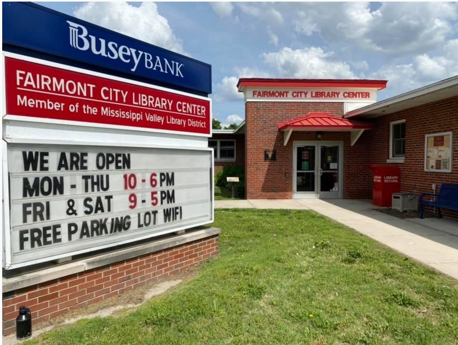
Fairmont City Library Center