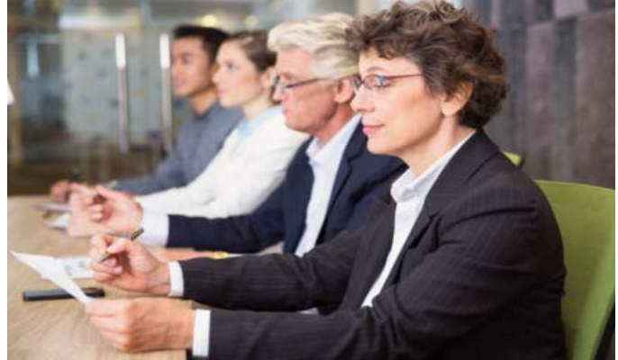
The office of county board member cannot be eliminated by referendum, as the office is mandated by constitution.

Every ten years, the county board in counties under township form, reapportion the county so that each member represents an equal number of residents. Since county boards are reapportioned every ten years, the length of terms are staggered (four, four, two years or two, four, four years). County commissioners serve rotating six-year terms.